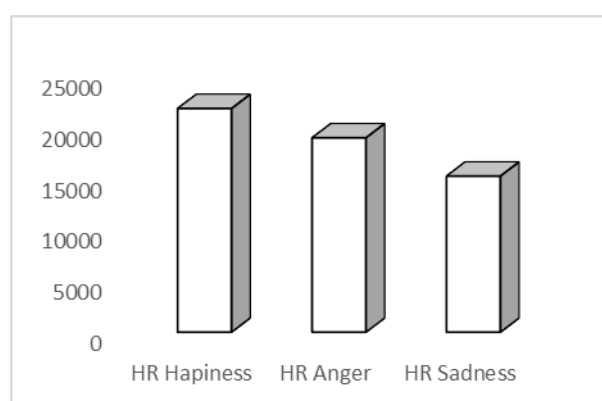
Table 2. Integration analysis of HR during each video (arbitrary units).

Regarding the psychophysiological assessment of the arousal induced by the videos, as shown in Table 2 and Table 3, our preliminary results suggest the existence of different patterns of psychophysiological reactivity based on the emotional content of each video, given the differences observed in the analysis of the integration of the GSR and the HR, even the small sample size (n=5) does not allow to assess the statistical significance of these findings.